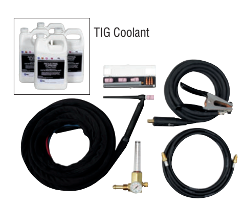
W-310 (CS310) Torch Kit for Syncrowave 350 LX TIGRunner