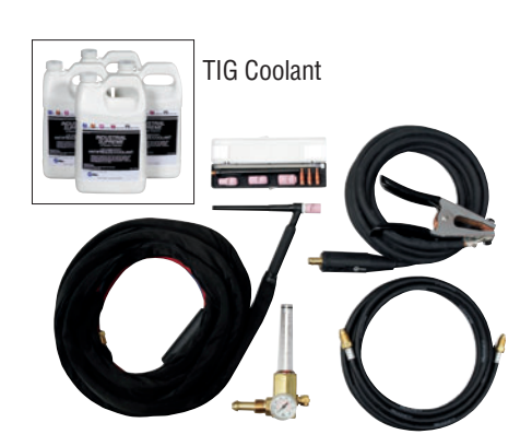
W-250 (WP-20) Torch Kit for Syncrowave 250 DX TIGRunner